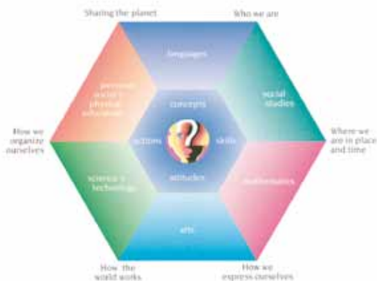
The PYP Structure

At the centre of the PYP curriculum are five essential elements: knowledge, concepts, skills, attitudes, and action. The aim of the program is to help students acquire a holistic understanding of six main themes, shown on the outside of the curriculum model, through the interrelatedness of these essential elements.