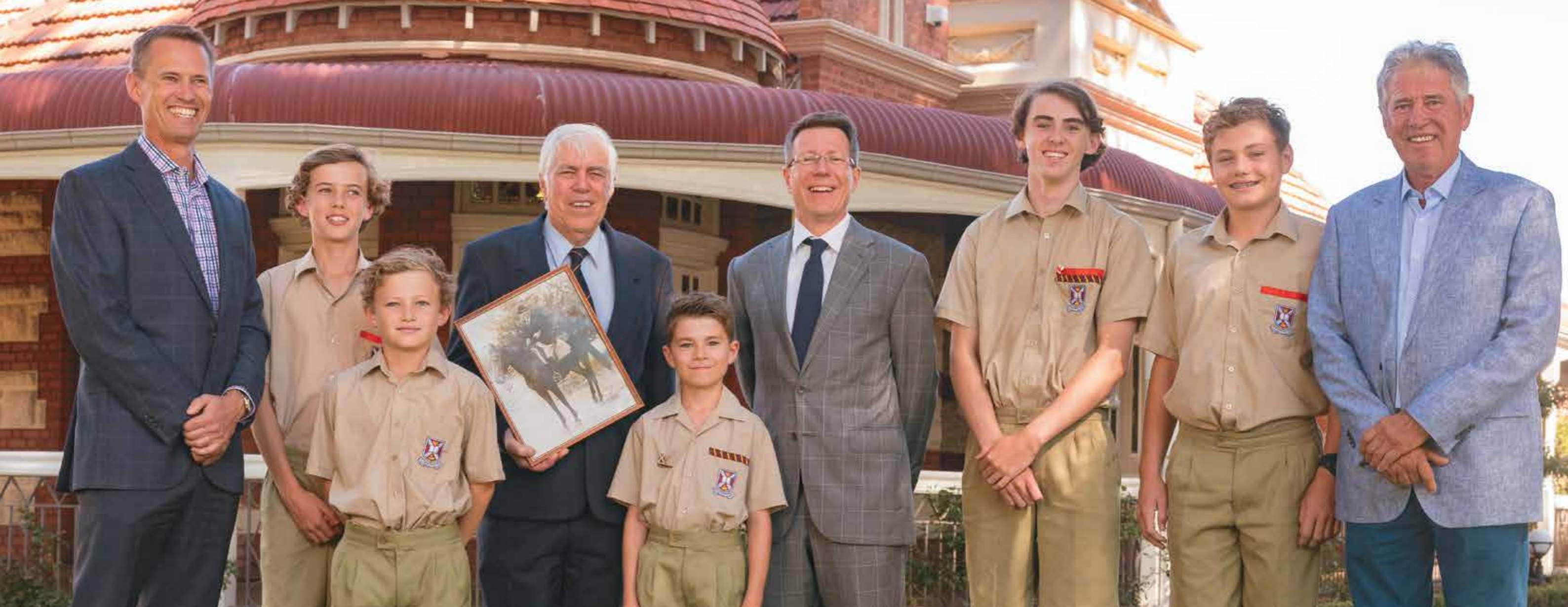
Celebrating four generations of the Hector family lineage.